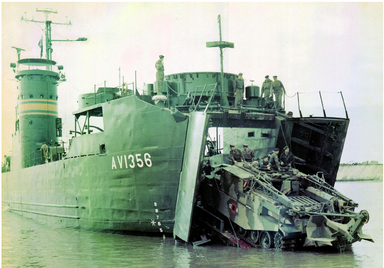
AV1356 Clive Steele with Centurion ARV at Stockton? Newcastle.