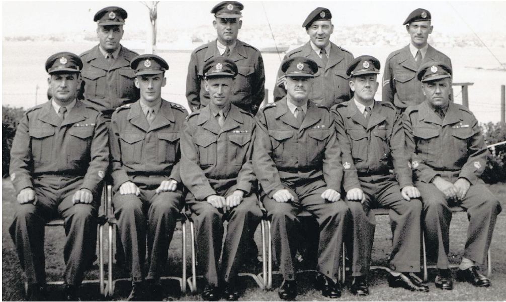
Chowder bay – 1959