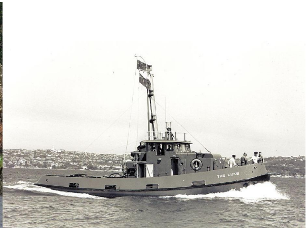
AT 2701 The Luke