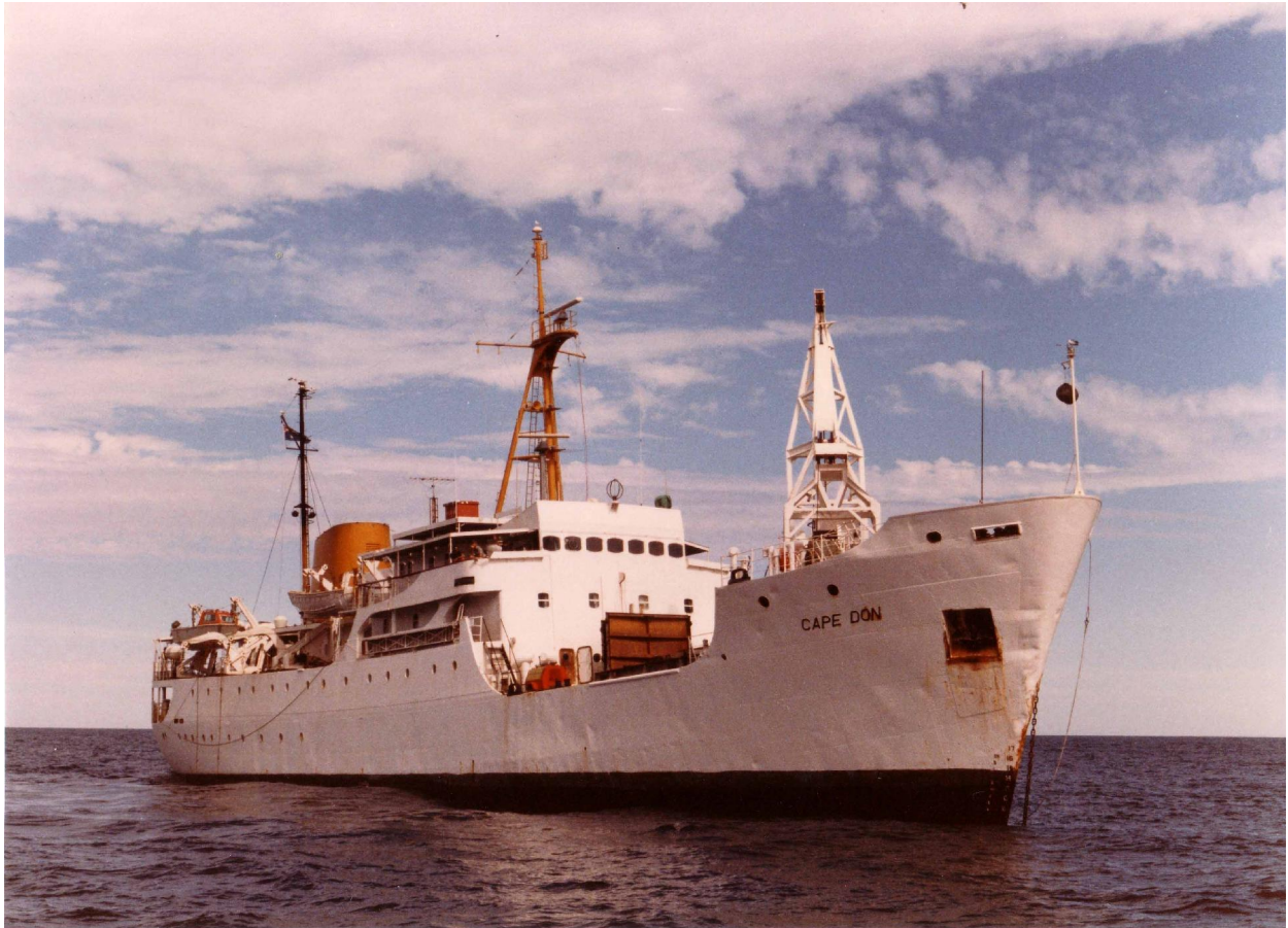
MV Cape Don off Port Hedland WA