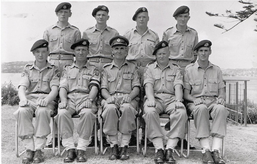
Chowder Bay – circa 1956