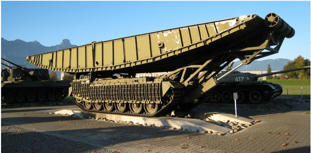
Centurion AVLB (Bridgelayer)

the situations such as this be as accurate as possible. I would appreciate any information you can offer. The ARV and AVLB are shown below: